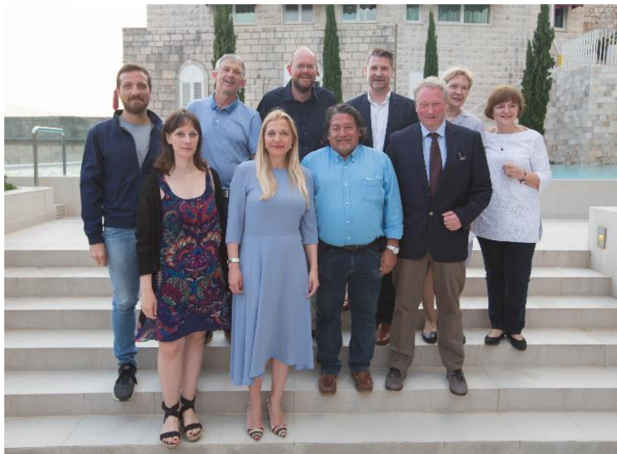
Faculty of the outreach meeting

The ESSR outreach meeting was organised by the ESSR ultrasound subcommittee and local organisers in collaboration with the Croatian society of Ultrasound in medicine and biology and the Croatian Medical Association.